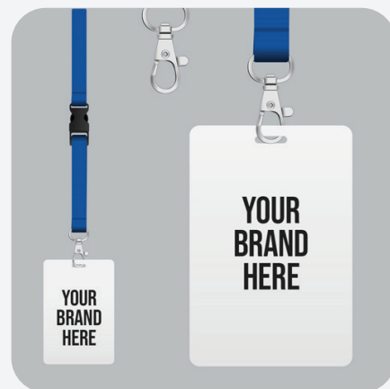
Badges with Lanyard