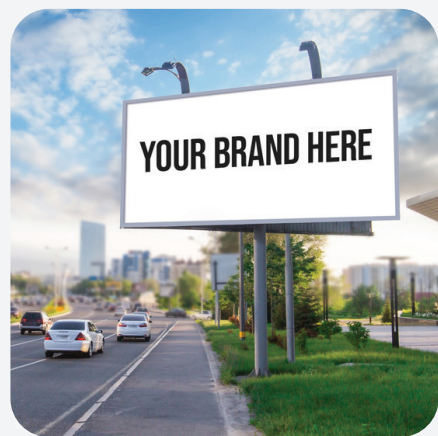
Bill Board (Size: 10x10 ft.)