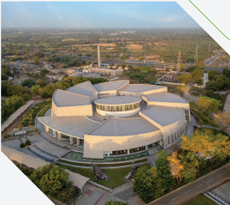
14-15 December, 2024 Vigyan Bhawan, Science City, Ahmedabad