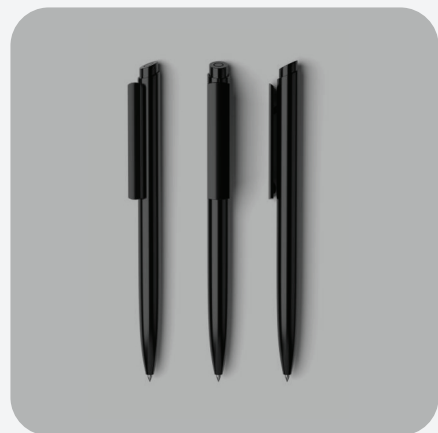
Pens Branding (5000 nos)