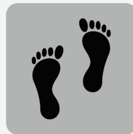
Footprints (05 Pieces)