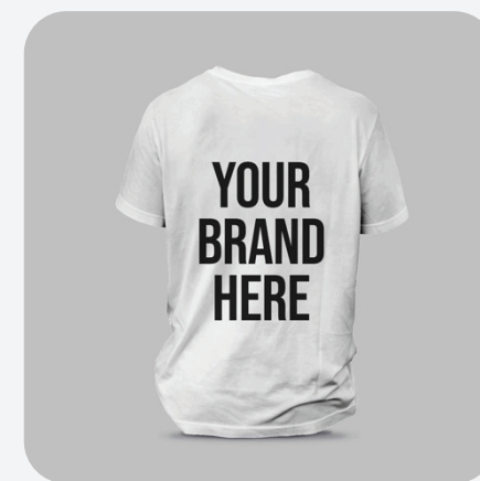
T-shirt Back Side Branding