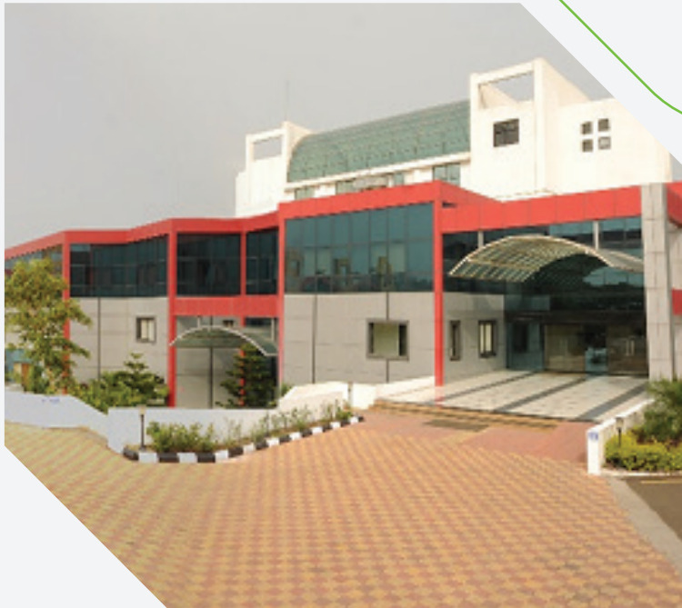
21-22 June, 2024 Auto Cluster Exhibition Centre, Chinchwad-Pune