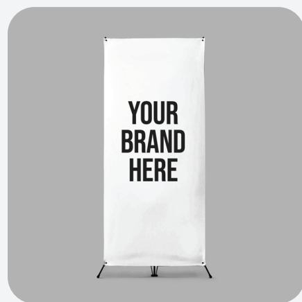
Standeers (Size: 02x06 ft.)