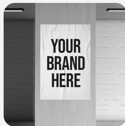
Pillar Branding (Size: 2x15 ft.)