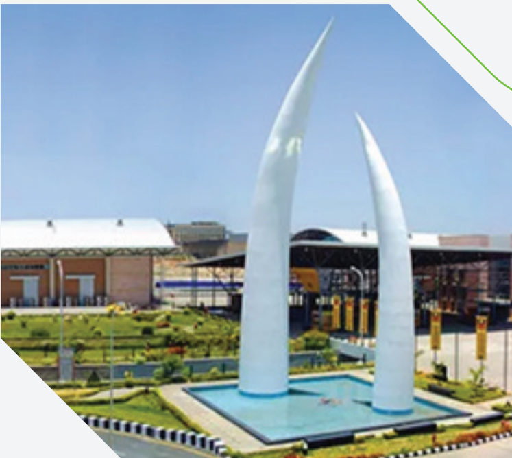
02-03 May, 2025 HITEX Exhibition Centre, Hyderabad