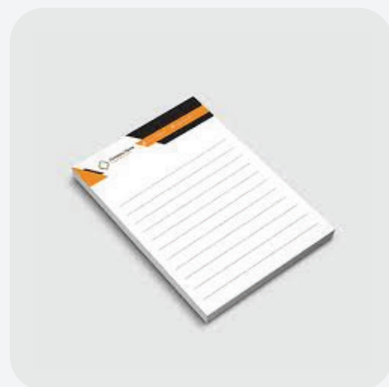
Notepad (1000 nos)