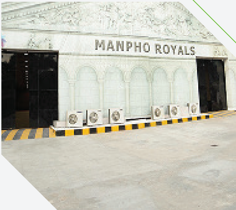
02-03 February, 2024 Manpho Convention Centre, Bangalore

Upcoming Exhibition in Mumbai 03-04 October, 2025 Bombay Exhibition Centre(NESCO), Mumbai